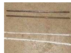
Borium & Hard Surface Rod